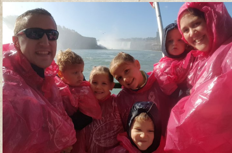
A family adventure at Niagara Falls!

2. God goes ahead of us. We have begun beautiful relationships with people and churches that God ordained. We could not have planned where or how these relationships would blossom. God knows exactly which churches we should visit and which people we should meet.