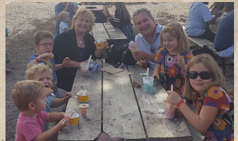
Sharing time with great supporters in Ohio!