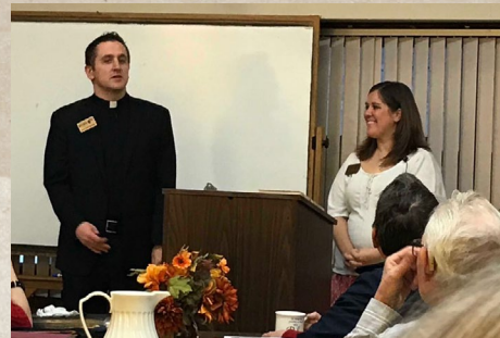
Presenting at St. Paul Lutheran Church in Ames, IA, a church we both attended growing up.

5. Renewing old friendships. We have had the opportunity to visit friends, family, seminary classmates, while traveling. What a privilege to renew those relationships and see first-hand where our loved ones are serving the Lord now.