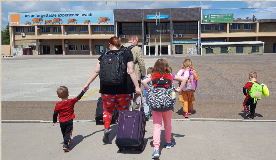
Our arrival at the airport in Maun. The kids did such a great job travelling!

We all hear these people speaking in our own languages about the wonderful things God has done! -Acts 2:11